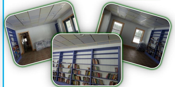
The Fernwood Cove Living Library is getting an update as well. New paint colors and comfy seating have been added. There will be other cozy details like curtains and rugs added before this summer!