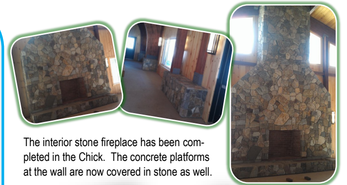
The interior stone fireplace has been completed in the Chick. The concrete platforms at the wall are now covered in stone as well.

There is something truly magical about camp—the same can be said in the winter months. While it's much quieter, the energy and enthusiasm of the Extraordinary World still follows us through each day. The days of green lawns and a mirror surface on the lake are replaced by a blanket of snow and crisp air. The energy and laughter of the campers, CITs and staff are replaced by the buzz of various construction tools, chatter of plans for new projects and the joy and laughter of recounting memories of the summers past when campers reenroll for the coming summer. This winter is no different—camp is abuzz with planning and projects and almost daily campers are enrolling for their first summer or to return to their summer home. Take a look at what's been going on at camp for the past few weeks—we can't wait for you to see it in person this summer!