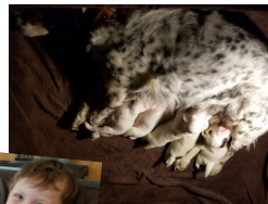
Bella and her new pups!