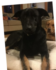
Bradley is a big boy!